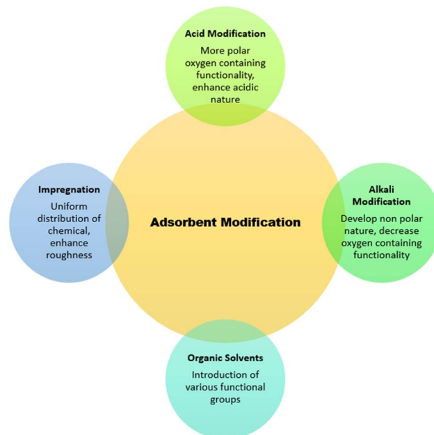
Fig. 4 Types of modification methods of adsorbents and their effects on properties.

The performance and efficacy of an adsorbent are characterized by factors, such as (a) large surface area, (b) high penetrability with small-sized pores, (c) thermal and chemical stability, and (d) good mechanical strength. 119 All these factors play positively towards the efficiency of adsorbents. Certain surface modification techniques are also in practice related to the enhancement of the adsorption capacity of adsorbent materials that revise the physical, biological, and chemical behaviors of substances (Fig. 4). 120 Adsorbent characteristics get enhanced by modifying the surface charge, roughness, surface area, and porosity, and these modifications are carried out by thermal, chemical, or mechanical procedures. Physical modification treatments favor enhancing the porosity, density, and solubility, while chemical treatments (involving alkali, acid, salt etc.) help in increasing the surface area. 121,122 Among the physical and chemical modification techniques, chemical treatment gives better results, as it directly influences the surface of adsorbents and not time-consuming along with some additional surface