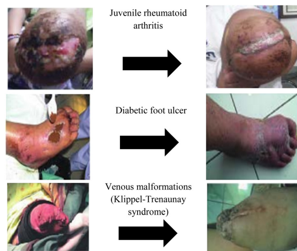
Fig. 3 Wound healing by coffee through human study. 81 Adopted with permission from ref. 81.

Histopathological studies on thirty-six New Zealand white rabbits supported the wound healing activity of green coffee bean extracts. Shahriari et al. 94 studied the green coffee bean extract in a full-thickness wound model. Coffee (10%) increased the wound closure rate, exhibited a shorter epithelialization