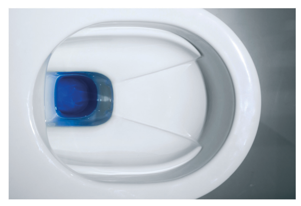
Fig. 3 The urine-separating toilet safe! from LAUFEN, implementing the urine trap. The special structures at the front-end of the toilet direct the urine towards the (nearly invisible) urine trap. 112123