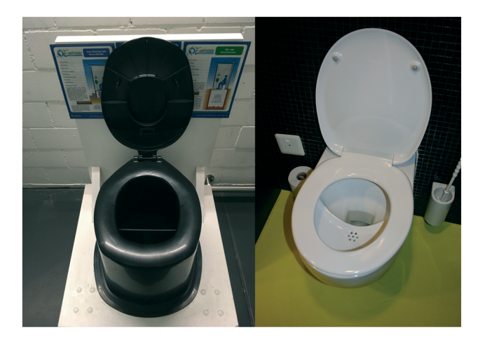
Fig. 1 The Envirosan urine-diverting dehydration toilet (UDDT: left) and the Roediger urine-diverting flush toilet (right).

some popularity as an alternative to conventional dry toilets, especially because they give rise to less odor.<sup>52</sup> In Durban, South Africa, a new law obliged the municipality to provide sanitation to all from 2001, resulting in the installation of double vault UDDTs to serve the areas without sewers.<sup>53</sup> With urine infiltrating the ground and alternate use of the fecescontaining vaults, it was possible to evacuate the vaults in a relatively safe way to gain organic matter for soil improvement. However, whereas Europeans are largely in favor of urine-separating flush toilets, albeit quite critical with respect to the toilet technology available,<sup>51</sup> the UDDTs are not at all popular in Durban.<sup>54</sup> With the flush toilet being the standard solution in the affluent parts of Durban, the affected population considers dry sanitation an unattractive and unjust solution for the poor.55