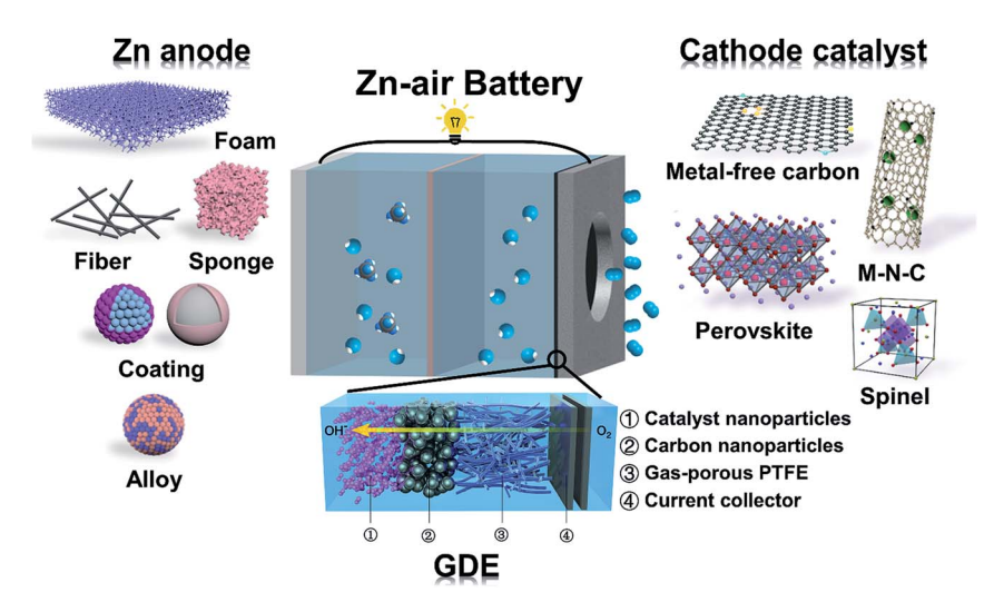
Fig. 1 Schematic configuration of Zn-air batteries including the GDE structure, different candidate materials for cathode electrocatalysts and different forms of Zn anode materials.

would have to be tackled with and resolved before Zn-air batteries are considered for large-scale industrial and commercial deployment. Through our discussions here, we call for a shift of research focus from cathode electrocatalysts to Zn anodes in order to expedite the future development of Zn-air batteries.