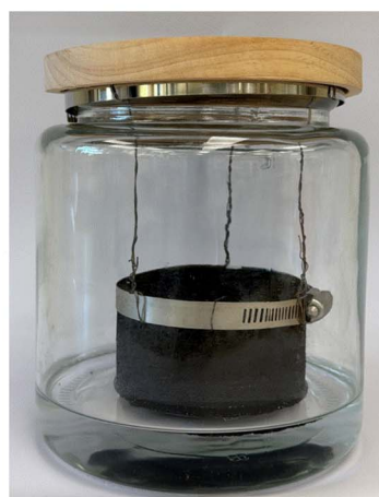
Fig. 1 Schematic and image of the experimental set-up for the static surface (core) leaching procedure (SSLP).