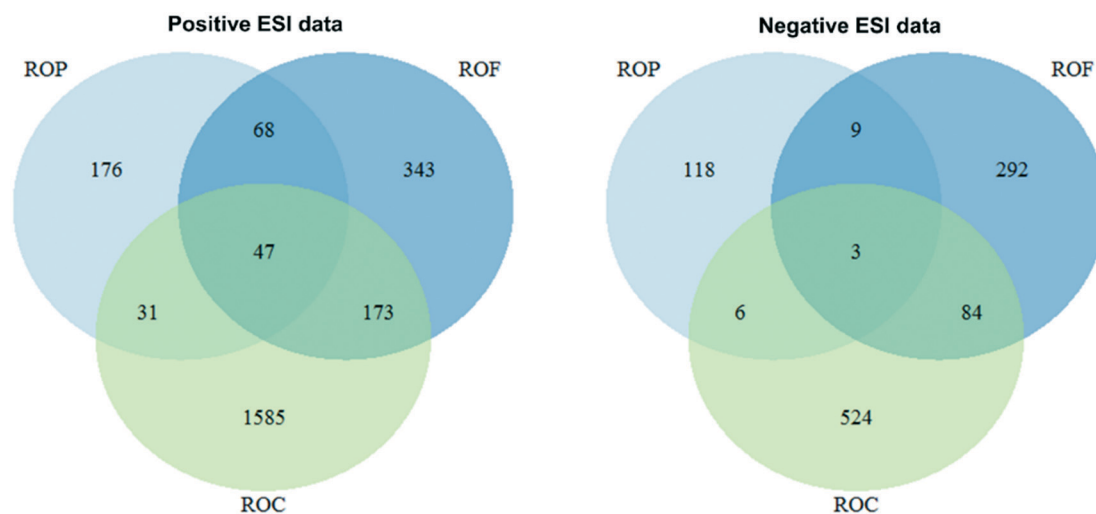
Fig. 2 Venn diagrams of non-target features in samples from the RO drinking water treatment plant detected in positive (left) and negative (right) electrospray ionisation (ESI) datasets. ROF: RO feed water; ROP: RO permeate; ROC: RO concentrate.

ROF = RO feed water (riverbank filtrate); ROP = RO permeate; REF = relative enrichment factor; the genotoxicity results of two independent experiments are reported: + = genotoxic; - = non-genotoxic. a One out of two procedural blanks was genotoxic in one replicate experiment, but negative controls were not. b One out of two procedural blanks was genotoxic in one replicate experiment, but negative controls were not.