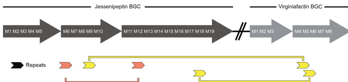
Fig. 8 Schematic representation of repetitive sequences in the jessenipeptin ( jes QS ) and virginiafactin ( vif ) BGC. red: jes QS -A6 Ala and jes QS -A12 Ala , yellow: jes QS -M9 Ser and vif QS -M5 Ser ; jes QS -M18 Ser and vif QS -M5 Ser (repetitive sequences were found using Repeat Finder of Geneious® Version 9.1.5).

Regarding NRPSs and NRPS/PKS hybrids, a great deal of attention has been attributed to analyzing the evolutionary history of the cyanobacterial biosynthetic machineries. 32–36 In particular, the biosynthesis of microcystin served as benchmark for these investigations. Additional insight in the toolbox of