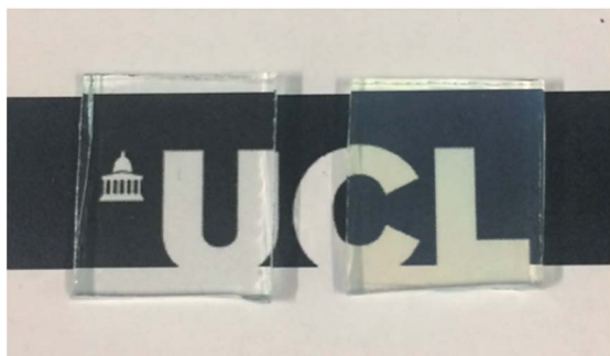
Fig. 2 Photograph of bare glass (left) and 7 mol% \text{FeCl}_3 loaded ZnO film (right).

All the films had good adhesion to the substrate, passing the Scotch tape test and steel scalpel scratch test. The films showed