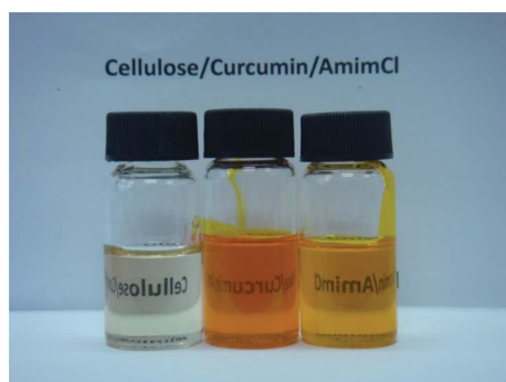
Fig. 2 The photographs of cellulose (left, 4%), curcumin (middle, 1%) and cellulose/curcumin solutions (right, 3% curcumin for cellulose) prepared with AmimCl solvent.

To evaluate the dispersion of the curcumin component in cellulose, SEM observations of the fracture surface of cellulose/curcumin composite films was carried out and the results are shown in Fig. 4. It can be seen that, when the curcumin content was below 4 wt%, the fracture surfaces of composites were compact and relatively smooth, which is similar to that of pure regenerated cellulose film. When the curcumin content was above 4 wt%, the fracture surface of cellulose/curcumin composite films became somewhat rough, but no obvious