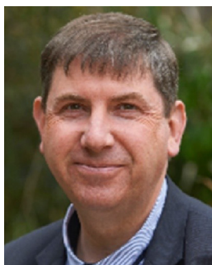
David J. Henry

Beyond these metal-based strategies, a host of other innovations is emerging in the fight against resistant bacteria. 39 Antimicrobial peptides (AMPs), for instance, inspired by natural immune defenses, offer a promising solution to combat bacterial resistance through their unique ability to selectively target bacterial membranes. These diverse small proteins, also known as cationic host defense peptides, are found in animals, plants, bacteria, and yeast, and can also be synthesized in laboratories. 40,41 AMPs exhibit broad-spectrum antimicrobial, antiviral, antifungal, and anti-mitogenic properties. Alongside their roles as immune modulators and anti-inflammatory agents, AMPs have potential as alternatives to conventional drugs. 42 Their mechanism of action, based on membrane