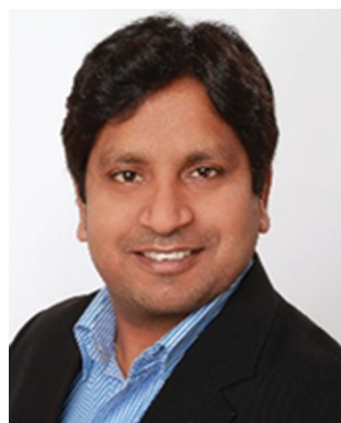
Yogendra Kumar Mishra

other 0–2D nanomaterials even though these show high surface area. 14 Such diverse characteristics of 3D morphologies make them promising materials with several combined functions into a single 3D morphology, which may facilitate multifunctional activities. 15 For example, such 3D morphologies may result in better transport properties in batteries/electrochemical devices. 13 Similarly, their interconnected pore structures are promising for charge carriers diffusion which improves stability and performance of devices. 16 Also, their unique 3D nano-microstructure provide better opportunities in terms of processability, integration with devices and may be customized in specific configurations for multifunctional applications. 17 These 3D nano-microstructures are further designed in different ways based on their physical appearance i.e. how they look alike. Generally, these structures are named on their similarity with natural things. For instance, 3D based NFs structures looks alike the natural flowers which are very fascinating because the variation of the arrangements of the building blocks. The building blocks could be another 0–2D nanostructures which provide a choice to tune the properties of