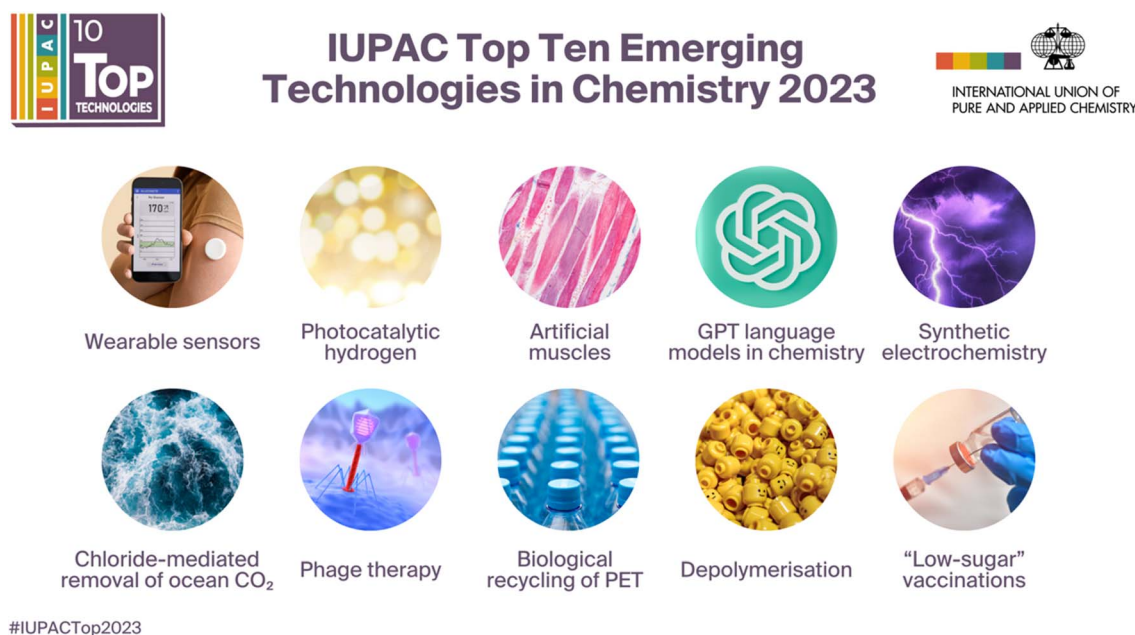
Fig. 2 A picture showcasing the latest “Top Ten” Emerging Technologies in Chemistry, an initiative pioneered by IUPAC.