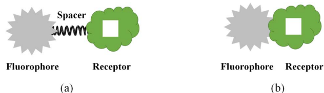
Fig. 3 Fluorescent sensor model (a) with and (b) without a spacer.

When the analyte binds to the guest acceptor, the photophysical properties of the sensor change through mechanisms such as photo-induced electron transfer (PET), intramolecular charge transfer (ICT), fluorescence resonance energy transfer (FRET), etc. 67–69