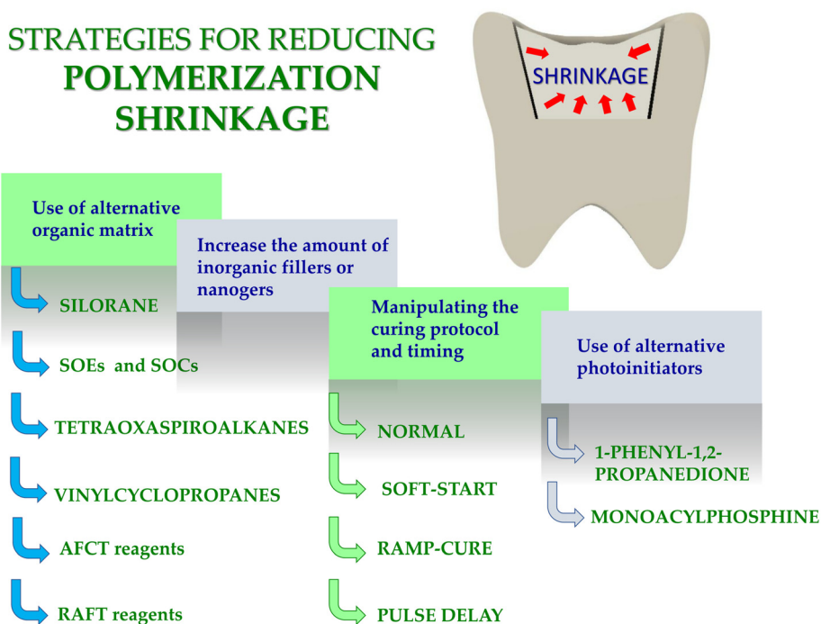
Fig. 1 Scheme illustrating strategies for reducing polymerization shrinkage.

5–15 MPa contraction stresses between the dental composite and the tooth, straining the interface, leading to detachment, microcracks and bending of the nodule. 38 The factor is not the polymerization shrinkage itself, but rather the stress generated by the reconstruction of the tooth interface, while the material shrinks in a confined environment such as tooth cavities or root canals. 39