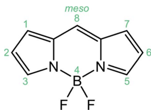
Fig. 1 Structure of the BODIPY core and IUPAC numeration.

substitution has a lower impact on the electronic properties and it can be used to append other chromophores in a supramolecular system or to append stimuli responsive units for sensing applications.