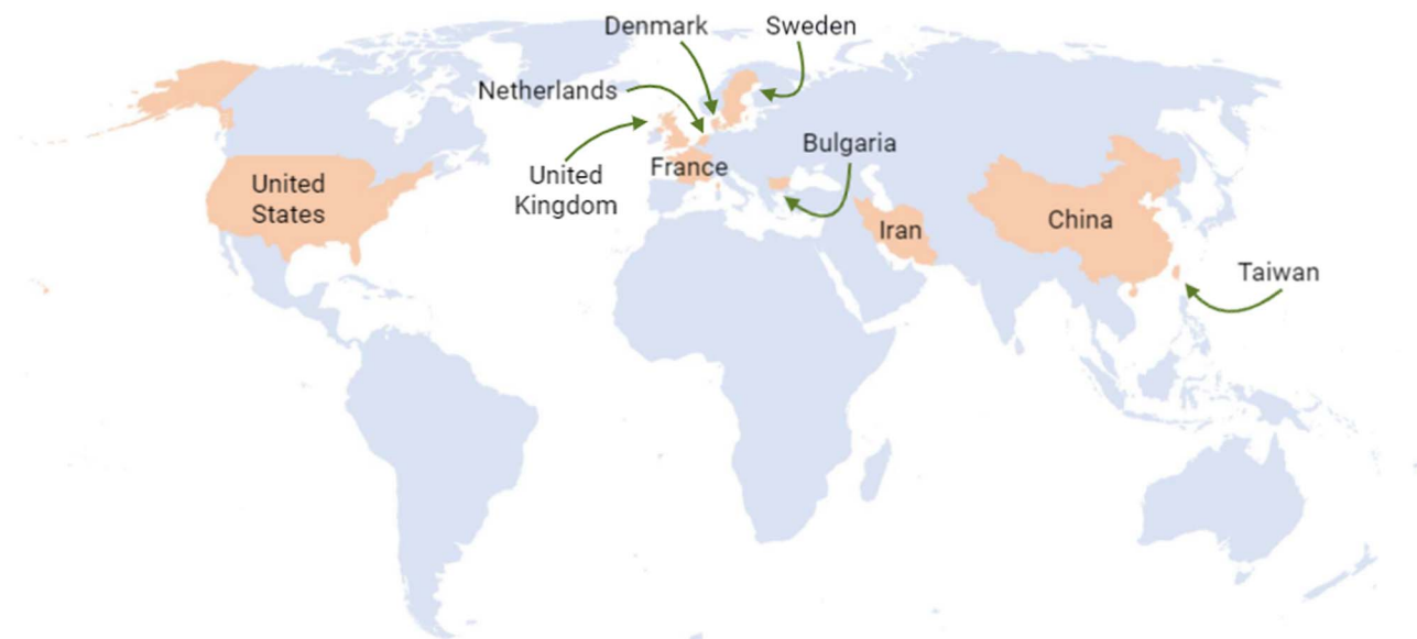
Fig. 5 Top ten countries with nanotechnology standards to date. 17,18 Original creation (using Excel and Biorender programs) based on information obtained from http://www.statnano.com (accessed on December 6th and 14th, 2023). 17,18

that some NMs have the same chemical formula as the other bulk materials; thus, NMs must be considered “new substances.” In this situation, the Royal Society and The Royal Academy of Engineering in the United Kingdom favoured treating chemicals in nanoforms as new substances under the Registration, Evaluation, Authorisation, and Restriction Chemicals (REACH) criteria. Similarly, The Danish Board of Technology (2006) proposed classifying NMs separately from existing chemicals. 135