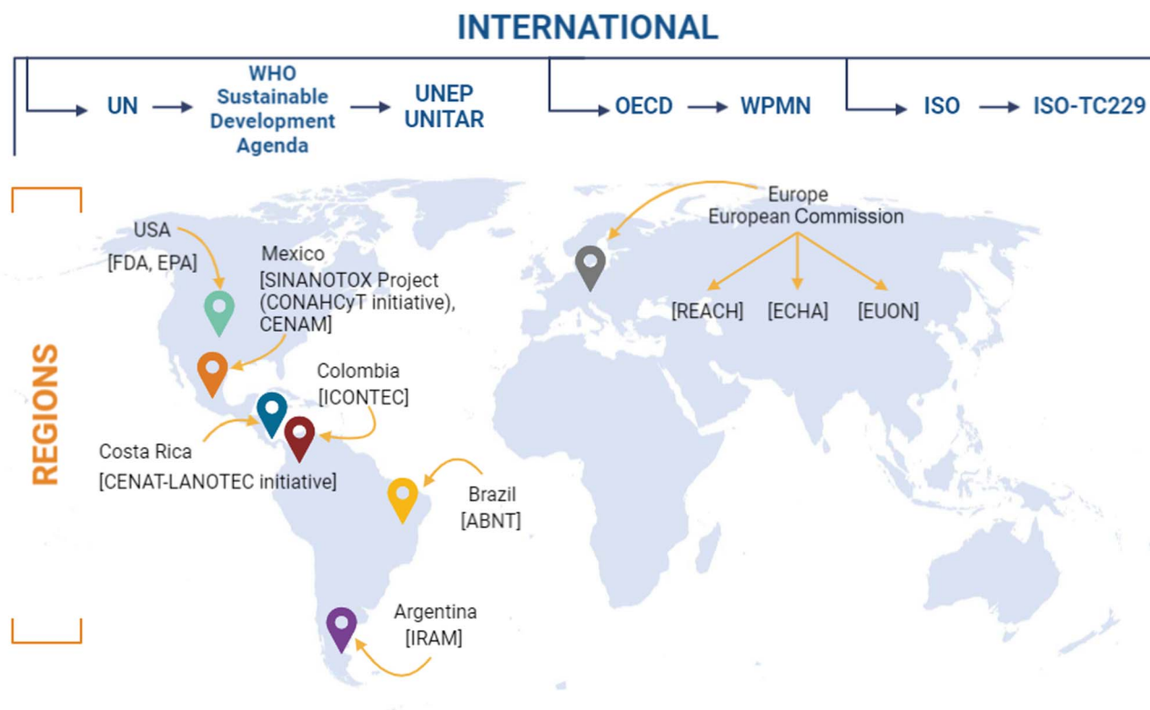
Fig. 4 National and international authorities, agencies and initiatives developing frameworks, legislations, and guidelines for nanomaterials. UN, United Nations; WHO, World Health Organisation; UNEP, United Nations Environment Program; UNITAR, United Nations Institute for Training and Research; OECD, Organisation for Economic Cooperation and Development; WPMN, Working Party on Manufactured Nanomaterials; ISO, International Organisation for Standardisation; ISO-TC229, International Organisation for Standardisation Technical Committee 229; USA, United States of America; FDA, Food and Drug Administration; EPA, Environmental Protection Agency; SINANOTOX, National Nanotoxicological Evaluation System Initiative; CONAHCyT, National Council of Humanities, Sciences and Technologies; CENAM, National Centre of Metrology; CENAT, National Centre of High Technology; LANOTEC, National Laboratory of Nanotechnology; ICONTEC, Colombian Institute of Technical Norms; ABNT, Brazilian Association of Technical Norms; IRAM, Argentinian Institute of Normalisation and Certification; REACH, Registration, Evaluation, Authorisation, and Restriction Chemicals; ECHA, European Chemical Agency; EUON, European Union Observatory for Nanomaterials. Original creation (using Excel and Biorender programs) based on information obtained from ref. 12, 31, 79–81, 94, 98, 115, 124–137, 143, 144, 159, 180, 189, 202–204, 269.

The momentum of nanotechnology development, establishment, and consolidation paths varies and differs between