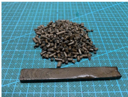
Fig. 18 100% natural biomass biodegradable thermoplastic material made from wood, stone and natural deep eutectic solvent. 86

from non-edible cheap materials, namely wood and stone. 86 The weight of wood and stone is over 51% and various types of waste wood, plant and paper can be utilized. Moreover, this material can be manufactured easily with a normal twin extruder, which is an advantage for industrial use. The important point is that this material can be quite cheap given that the raw material and manufacturing cost will be economically friendly. A disadvantage is its weak water resistance, which is an issue for real industrial applications. However, this material has a relatively high compatibility with various type of bioplastics and petroleum-derived plastic such as PHBV, PP, and PE and water resistance can be recovered when it is mixed with other plastics. Given that a high quantity of material can be mixed with other plastics, we expect that it will be used as bulking agent for other plastics to increase their biomass content and biodegradability. Furthermore, marine biodegradability can be expected for this material, which is under investigation.