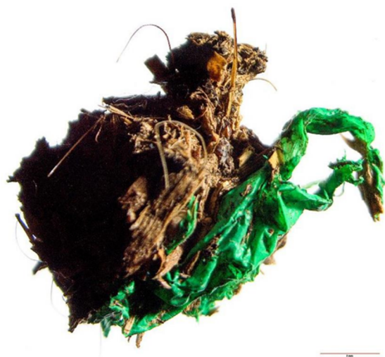
Fig. 3 Examples of microaggregates containing polymers. Scale bar = 2 mm.

Improving test strategies for the environmental hazards of polymers. Given the above considerations, more testing needs to be done to comprehensively understand the environmental hazards of weathering and degradation products of polymers, as well as the actual uptake and chronic toxicity of different polymer groups. This is particularly crucial for polymers with high production volume and/or wide dispersive potential (see Fig. 1 and Section 3.4).