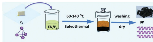
Fig. 5 Schematic representation of the synthesis of FLBP via the solvothermal process (reproduced from M. Pica and R. D'Amato, Chemistry of Phosphorene: Synthesis, Functionalization and Biomedical Applications in an Update Review. Inorganics , 2020, 8(4), 29.; published by MDPI, Basel, Switzerland). This article is an open access article distributed under the terms and conditions of the Creative Commons Attribution license ( https://doi.org/10.3390/inorganics8040029 ).

Tian et al. , in their paper, discussed the synthetic process for FLBP nanosheets in gram-scale quantities through the bottom-up approach. They have used white phosphorus as the raw material, which involves an ethylene diamine system of the direct solvothermal process operating in a temperature range of 60–140 °C, as shown in Fig. 6. The 2-D material has