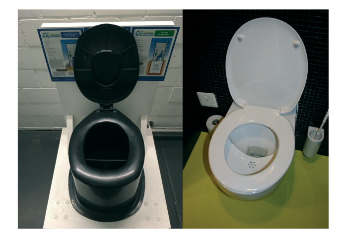
Fig. 1 The Envirosan urine-diverting dehydration toilet (UDDT: left) and the Roediger urine-diverting flush toilet (right).

some popularity as an alternative to conventional dry toilets, especially because they give rise to less odor.<sup>52</sup> In Durban, South Africa, a new law obliged the municipality to provide sanitation to all from 2001, resulting in the installation of double vault UDDTs to serve the areas without sewers.<sup>53</sup> With urine infiltrating the ground and alternate use of the fecescontaining vaults, it was possible to evacuate the vaults in a relatively safe way to gain organic matter for soil improvement. However, whereas Europeans are largely in favor of urine-separating flush toilets, albeit quite critical with respect to the toilet technology available,<sup>51</sup> the UDDTs are not at all popular in Durban.<sup>54</sup> With the flush toilet being the standard solution in the affluent parts of Durban, the affected population considers dry sanitation an unattractive and unjust solution for the poor.55