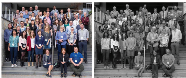
Photos of the Authors from the UV4Plants 2 nd Network meeting in Bled, Slovenia. (A. visible light, B. UV-A image)

This article was authored by participants in a discussion on the future of plant-UV research at the 2 nd Network Meeting of UV4Plants ( https://uv4plants.org/about/ ), the International Association for Plant UV Research, in Bled Slovenia, April 2018. UV4Plants was established in 2014 following a successful EU COST Action UV4growth, to promote excellence in plant UV research. UV4Plants functions as a forum for photobiologists in plant UV photobiology to collaborate and disseminate research findings with each other and for application beyond academia. As well as leading scientists in plant biology, graduate students are well represented, as reflected in the authorship of this Perspective.