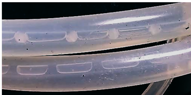
Fig. 5 Image of crystallisation tubing within the cooling tubing jacket at the beginning of the KRAIC. Lower tube is 0.3–0.5 m crystallisation length (32–28 °C), upper tube is 0.9–1.1 m (25–23 °C). N.B. crystals can be seen in solution slugs within the upper tubing.

As for many molecular materials of interest in, for example, the pharmaceutical industry, pyrazinamide is polymorphic. The solid form obtained, and its selectivity, is a vital consideration for crystallisation process development within overall production process design. Pure \gamma -pyrazinamide was obtained from controlled and uncontrolled nucleation runs where blockage events were minimised (ESI;† Fig. S7 and S8). This polymorphic form is normally obtained from melt 16,17 or sublimation 17,18 crystallisation and previously reported solution-based crystallisation of pure \gamma -pyrazinamide has exclusively in-