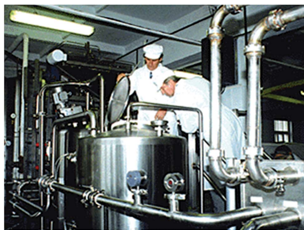
Fig. 5 The \text{MAG}^*\text{SEP}^{\text{SM}} milk decontamination system at Ovruch, Ukraine 1997. 1

Very recently, Yang et al. 89 reported the synthesis of chitosan grafted magnetic bentonite using a plasma induced grafting method and investigated its potential usage as an adsorbent for radioactive cesium in simulated groundwater and seawater (sampled from Pacific Ocean near Hamamatsu, Japan). The results showed enhanced coagulation due to plasma modification. In addition, this material exhibited good magnetic sensitivity as well as low turbidity and high stability in the seawater sample. Multifunctional adsorbent with superparamagnetic and PB particles was synthesized in the presence of sepiolite silicate (as porous platform) by one pot method. 87 The efficacy of the resulting nanostructure was determined for the adsorption of Cs ions from aqueous media. The maximum Cs removal capacity was 102 \text{ mg g}^{-1} at 22^\circ\text{C} in DI water. The thermodynamic studies suggested that Cs adsorption onto \text{Sep}/\text{NPPB} was