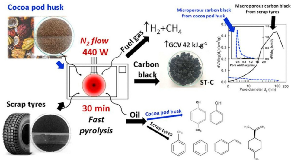
Fig. 5 Illustration of microwave pyrolysis process. Reproduced from ref. 35 with permission from Elsevier, copyright 2025.

Another promising technology is supercritical fluid extraction, which employs supercritical CO 2 or other fluids to recover valuable oils and chemical components from tires. This method operates under high pressure and temperature, allowing for the selective extraction of compounds without the use of harmful solvents. It has been shown to be effective in extracting plasticizers, antioxidants, and oils from rubber, potentially offering a cleaner and more efficient recycling route. 40–42 Additionally, electrochemical processing is being explored as a method for the selective breakdown of tire components. Through controlled electrochemical reactions, this technique can facilitate the recovery of valuable materials such as metals and carbon black, while reducing the environmental footprint of the recycling process. Although still in the research phase, electrochemical approaches hold potential for more precise and energy-efficient recycling. 43–45 Collectively, these emerging technologies aim to improve the environmental performance, product quality, and economic feasibility of tire recycling. As these innovations continue to evolve, they could