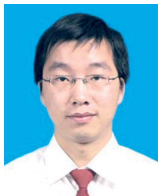
faculty of the Department of Chemistry, Tsinghua University in 2012.