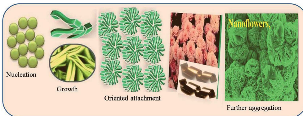
Scheme 1 Plausible mechanism for formation of 3D-nanoflower-like Cu foil coated with CuO (inset: photo image of undeposited and deposited CuO nanoflowers on flexible Cu foil by chemical bath deposition method).

representation of selected aspects of CuO for supercapacitor applications.