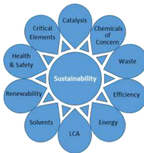
Figure 1: Summary of the Key Parameters covered by the metrics toolkit.

The metrics within the Toolkit needed to be universally recognised and agreed upon in order for widespread adoption and application. Of course the metrics toolkit was not able to cover everything, and to remain practical, compromises and assumptions had to be made. A delicate balance needed to be struck between the metrics toolkit being sufficiently complex to be comprehensive in order to cover all Key Parameters, while also being straightforward enough to be practical in terms of ease of use. Thus, the metrics adopted were chosen to be simple but not simplistic.