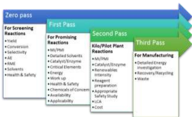
Figure 2: Structure of the Metrics Toolkit showing the parameters covered at each Pass.

It was vital that the toolkit, was sufficiently straight-forward to be used quickly and easily in order to support regular monitoring and iterative process improvements by researchers. This requirement had to be balanced against the need to cover the key parameters in sufficient depth. In order to address this, the toolkit was split into a number of passes/levels with increasing complexity as the synthesis moves from discovery, through scale-up, towards commercialisation (Figure 2). In doing so, the toolkit meets the goals of being both user-friendly and comprehensive, with a level of detail commensurate with the stage of research.