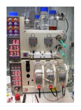
Figure 4; VapourTec® R2+ R4 Unit

The R2+ unit consists of two HPLC pumps that can be easily monitored and adjusted. The pumps can operate between reaction pressures of 1-50 bar and flow rates of 0.05-10.0 mL/min per channel with easy switching between reagent and solvent inputs. Reagent addition can be achieved via a continuous mode by passage of a stock solution through the pump heads or employing single alloquot injection via the two in-line sample loops. The R4 is a heater unit, which can accommodate up to four independently heated reactors. Precise temperature control and measurement is possible over the temperature range of ambient to 150 °C. Very high heating and cooling rates (up to 80 °C/min) allow for quick temperature changes. Glass Omnifit® columns and supplied housing were used to prepare the monoliths as previously described. [8]