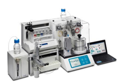
Figure 5; Uniqsis FlowSyn unit with ALF automation

The FlowSyn Automated Loop Filling (FlowSyn Auto-LF) is a module which includes an auto-sampler and a fraction collector, allowing the preparation of libraries. It loads and collects reactions simultaneously, integrating wash steps to prevent cross-contamination using a Gilson 10 ml Syringe pump. The solutions of the starting materials are prepared in vials including septum-protected caps and loaded into an intermediate holding coil, which incorporates air bubbles to prevent sample dispersion and dilution, and directly transferred to the sample loops. The final products are collected using a rack of vials. The module also includes a laptop with software for both programming and real-time monitoring of the experiments (pressure and temperature plots), generating a sounding alarm when the pressure of the system drops due to air bubbles and giving 1 min to purge the pumps before the system stops.