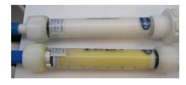
Figure 2. Monolith monomer composition (wt%); lower picture top: polymerised monolith bottom: iridium loaded monolith.

(total time 20 h). The solution was then changed to neat DCM and the column washed for a further 4 h.