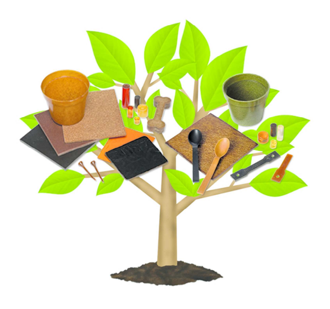
Graphical Abstract 50x50mm (300 x 300 DPI)