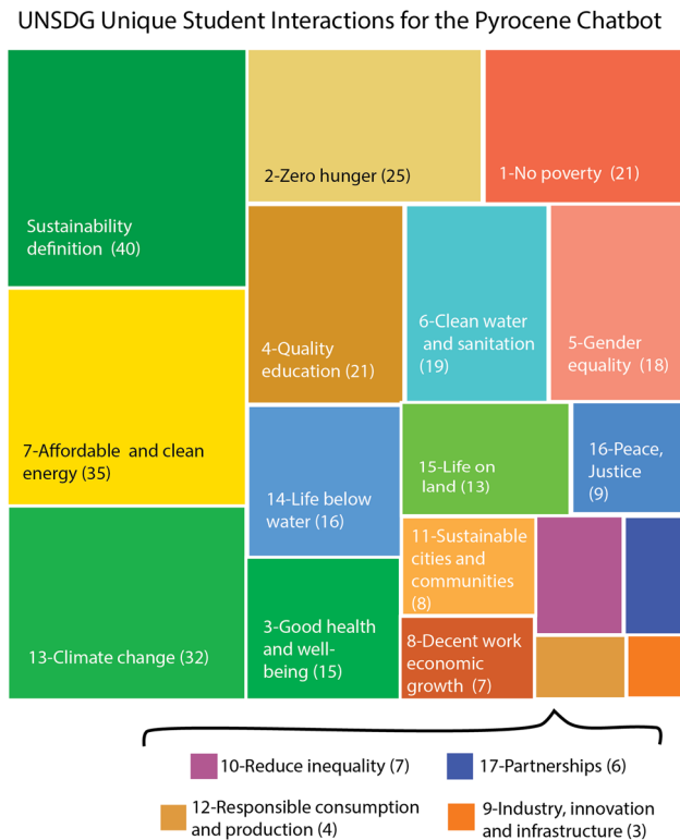
Fig. 3 Tree map of the unique student interactions that students had with the sustainability module in the Pyrocene curated chatbot.

Students also explored SDGs associated with hunger, poverty, and quality education, as indicated by a higher-than-expected number of visits to SDG 1, 2, and 4.