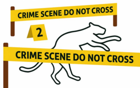
Fig. 3 The activity poster for Momentum Lab (AI-generated).

Chemistry served as the anchor discipline, providing analytical techniques, such as chemical fingerprinting, spectroscopy, and trace element analysis, that underpin modern forensic science and enable the solving of crimes through chemical evidence. These techniques were presented not only as tools for investigating wildlife crime but also as approaches that inform sustainable practices. By linking the activity to global challenges and UN SDGs 3, 4, 15, and 16, forensic chemistry was situated within broader ethical and societal contexts. This integration promotes sustainable thinking by demonstrating how chemical evidence can guide conservation strategies, prevent illegal exploitation, and contribute to long-term ecological resilience. Furthermore, chemistry plays a critical role in health by enabling the detection of toxins, contaminants, and disease-related biomarkers, showcasing its wider applications through techniques such as chromatography, spectroscopy, and molecular analysis. This is highly beneficial for students, as it highlights the relevance of chemistry across diverse real-world contexts beyond the laboratory.