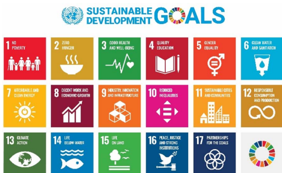
Fig. 1 The 2030 United Nations Sustainable Development Goals ( https://www.un.org/sustainabledevelopment/news/communications-material/ ).

Wentworth Institute of Technology, located in Boston, places a strong emphasis on experiential learning. Each summer, the university hosts two immersive pre-college programs, Momentum Lab and Impact Lab, designed to engage high school students in hands-on learning that fosters critical thinking, problem-solving, and collaboration. Both programs