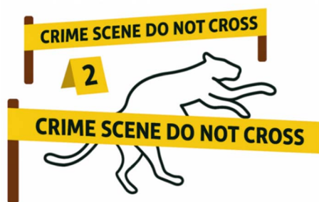
Fig. 3 The activity poster for Momentum Lab (AI-generated).

Chemistry served as the anchor discipline, providing analytical techniques, such as chemical fingerprinting, spectroscopy, and trace element analysis, that underpin modern forensic science and enable the solving of crimes through chemical evidence. These techniques were presented not only as tools for investigating wildlife crime but also as approaches that inform sustainable practices. By linking the activity to global challenges and UN SDGs 3, 4, 15, and 16, forensic chemistry was situated within broader ethical and societal contexts. This integration promotes sustainable thinking by demonstrating how chemical evidence can guide conservation strategies, prevent illegal exploitation, and contribute to long-term ecological resilience. Furthermore, chemistry plays a critical role in health by enabling the detection of toxins, contaminants, and disease-related biomarkers, showcasing its wider applications through techniques such as chromatography, spectroscopy, and molecular analysis. This is highly beneficial for students, as it highlights the relevance of chemistry across diverse real-world contexts beyond the laboratory.