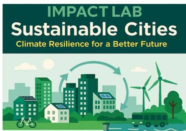
Fig. 4 The activity poster for Impact Lab (AI-generated).

Table 1 provides a summary of quantitative feedback from all nine students enrolled in the author's class. The data combine ratings of satisfaction with faculty interaction and the likelihood of applying to another program.