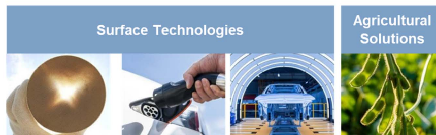
Fig. 2 BASF's segments, comprising its core businesses in Chemicals, Materials, Industrial Solutions and Nutrition and Care, as well as stand-alone businesses in Surface Technologies and Agricultural Solutions.

Initiatives such as the “Eco-Efficiency Analysis” (1996) 9 and the “Sustainable Solution Steering” method (2012) were implemented to assess the environmental impact of products and