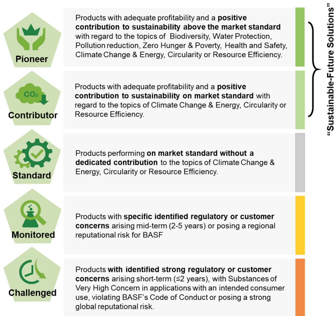
Fig. 21 Sustainable solution steering approach for the product portfolio segmentation, and corresponding target setting and monitoring. The benchmark is dynamic: the market standard in terms of sustainability performance will change over time.

aiming at increasing the share of sales from Sustainable-Future Solutions from 41% (2023) to more than 50% by 2030. To achieve this, BASF employs the TripleS (Sustainable Solution Steering) methodology. The methodology involves a two-step analysis. A first step ensures compliance with BASF's Code of Conduct, relevant regulatory frameworks such as REACH and TSCA, customer needs, and emerging regulations. Products that pass this check proceed to the second step, the check for sustainability value contribution: this step evaluates how a product compares to standard market solutions in terms of sustainability performance. Based on this analysis, products are segmented into five categories: pioneer, contributor, standard, monitored, and challenged (Fig. 21). To manage the extensive data required for these assessments, BASF relies on semi-automated digital in-house workflows, integrating data from other internal BASF systems. The TripleS methodology is dynamic and iterative: products initially classified as innovative may become market standards and eventually be reclassified due to new research findings or regulatory changes. BASF decided to phase out products classified as Challenged within five years of their initial classification,