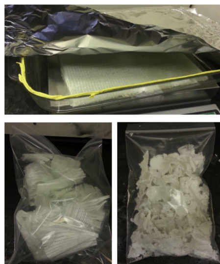
Fig. 10 Demonstration of fiber (bottom left) and polymer (bottom right) recovery by dissolution from a glass-fiber-reinforced composite (top) using Elium as the resin. Reproduced from ref. 102 with permission from Elsevier, J. Cleaner Prod. , 2019, 209 , 1252–1263, copyright 2019.

Because the curing of these resins often proceeds through highly viscous states accompanied by polymerization-induced vitrification and strong reaction-transport coupling, they provide practical examples where the phenomena discussed in the previous sections become technologically relevant. Due to their strength and lightweight, fiber-reinforced plastics span their application area. 96–98 Carbon fiber-reinforced plastics are used in advanced technology for airplanes and sports utilities, whereas glass fiber-reinforced plastics are used for wind turbine blades. Generally, thermosets, including epoxy resin