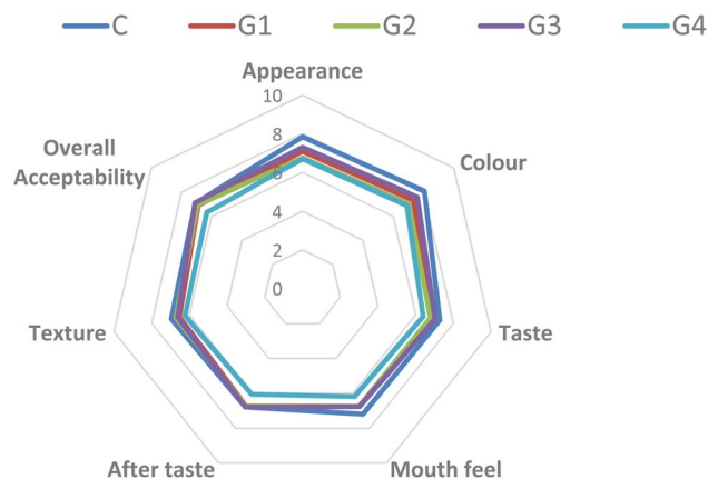
Fig. 2 Sensory score of gummies. G1 = 0.5% encapsulates added, G2 = 1% encapsulates added, G3 = 1.5% encapsulates added and G4 = 2% encapsulates added.

gummies. Thus, it can be assumed that along with the control gummy, the G3 gummy showed the best consumer acceptability.