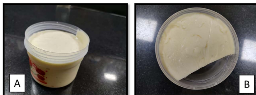
Fig. 3 (A) Probiotic processed cheese and (B): sliced probiotic processed cheese.

a Mean ± S.D ( n = 3 ); means with different superscripts within a row differ significantly ( p < 0.05 ).