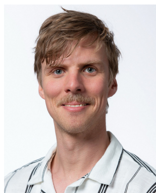
Ricardo P. M. Duarte

and capacity can be scaled independently. This feature allows application to a wider range of scenarios without compromising cost. Many chemistries can be employed in this configuration with the most mature ones being vanadium, and Zn–Br batteries. 10,11 Although total installed flow battery power and capacity comprises 5–10% of that of Li-ion, 4 commercial projects up to 100 MW and 400 MWh have been installed showing its promise in large scale storage. 12 However, even though these technologies have matured significantly over the years, they still lack the necessary specifications to be applied at such large scales. Zn–air batteries are a promising technology to fulfil this role, if their rechargeability issues are solved.