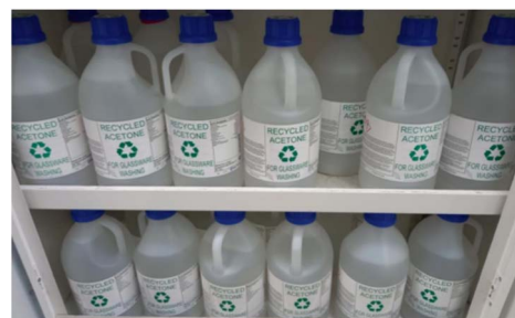
Fig. 3 Recycled bottles for recycled acetone.

By far the largest impact on carbon emissions is in the production and incineration of acetone respectively. After the initial three-month period of recycling, acetone purchasing had reduced by 40%, which would in turn correspond to an 66% reduction in carbon emissions (Table 2), assuming no acetone is incinerated. This assumption is discussed in further detail in SI Section 2.3.3. Depending on the assumptions used, using purchasing data to estimate the acetone reservoir (Fig. 1), carbon reduction could be between 54% and 87%, but of course this is still an estimate and should be interpreted as such (SI 2.3.3). While it does take energy to run the recycler, the scale compared with the production and incineration of virgin