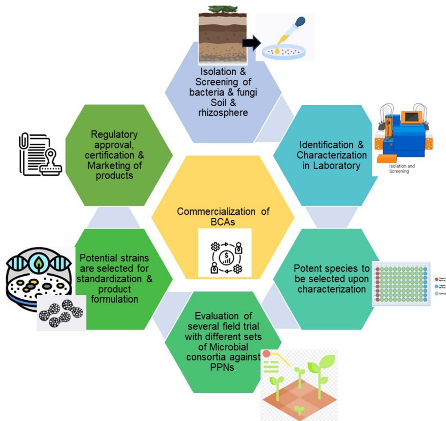
Fig. 4 Schematic showing the commercialization process of BCAs.

biocontrol; yet, barriers to BCA registration may deter the use of commercial plant protection solutions.