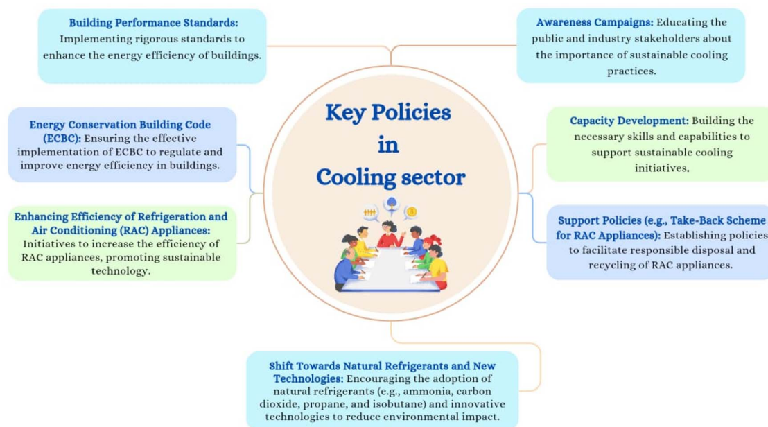
Fig. 1 Key policy aspects in the cooling sector.