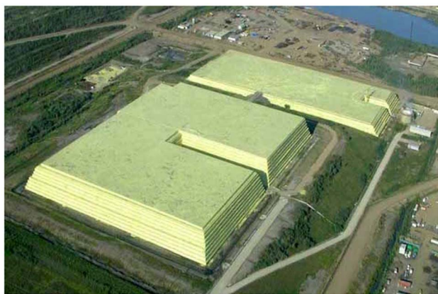
Fig. 2 Sulfur pyramids in Alberta, Canada. Source: https://www.enersul.com/operations/ .

for processing phosphate rock and metallurgical ore leaching. Other existing utilisations of sulfur, such as in pigments, pesticides, and rubber vulcanisation and use as an agricultural nutrient, are well established and offer limited opportunities for consuming significant new sulfur supplies. 11