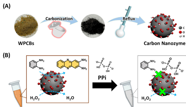
Scheme 1 Schematic illustration of (A) the PPI-responsive CNZ synthesized from WPCBs; (B) PPI induced the peroxidase-mimicking CNZ activity inhibition.

generation, which can regulate the CNZ catalytic activity. These peroxidase-mimicking CNZs can catalyze o -phenylenediamine (OPD) oxidation to produce a yellow product (2,3-diaminophenazine, DAP) when H 2 O 2 is introduced. As demonstrated in Scheme 1B, the PPI addition subsequently leads to notable suppression of the CNZ peroxidase-mimicking activity. As compared with other catalysts, only CNZs display the PPI-induced inhibition effect. This finding suggests a specific interaction between CNZs and PPI even within the complex reaction mixture. To further clarify this interaction for responsive inhibition, kinetic analyses based on the Michaelis–Menten model are utilized to reveal the detailed mechanisms disrupting the reactions of H 2 O 2 and OPD substrates individually. Building on these efforts, the PPI-responsive effect on WPCB-derived CNZ catalysis shows notable selectivity, successfully differentiating between urinary interference species and, particularly, other phosphate analogs. The remarkable recognition capability of the WPCB-derived CNZs enables highly sensitive and precise analysis of PPI using colorimetric methods to monitor inhibition efficiency, even in complex sample matrices. Our research demonstrates a sustainable strategy for engineering waste-derived nanozymes with intrinsic molecular selectivity, expanding their applicability in advanced biosensing and diagnostic platforms.