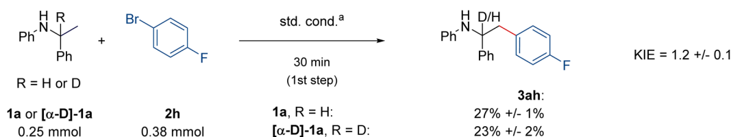
Fig. 4 Control mechanistic experiments. a Standard conditions reported in Fig. 3. b Yield of imine-3ah was measured upon HCl-mediated hydrolysis to a ketone derivative; for details, see the ESI.†

(d) \alpha -Deuterium containing amine undergoes \beta -arylation with similar rates to the amine containing protium in \alpha -position