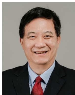
Ben Zhong Tang

Shenzhen University. Her research interests include the development of new alkyne-based polymerization reactions and the design, synthesis, and applications of functional luminescent polymers.