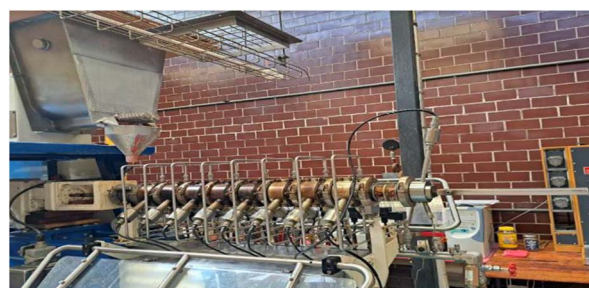
Fig. 1 Twin-screw extruder.

Based on preliminary results the screw speed was set at 230 rpm, with water flows of 2.6 and 3.5 L h -1 and an AO flow of 0.36 L h -1 , which were pumped using a peristaltic pump in modules 2 and 3 respectively. The hopper fed the raw material at a rate of 0.7 kg h -1 . A maximum barrel temperature of 165 °C was used and, as an example, Table 1 shows the temperature profile used per module. An elongated nozzle ( i.e. module 10) was placed at the extruder outlet and covered with dry ice to promote the formation of the fibrous structure. This rectangular nozzle chamber was 30 cm long. The inner rectangle of the nozzle was 4 cm long and 0.5 cm wide. Water flow and