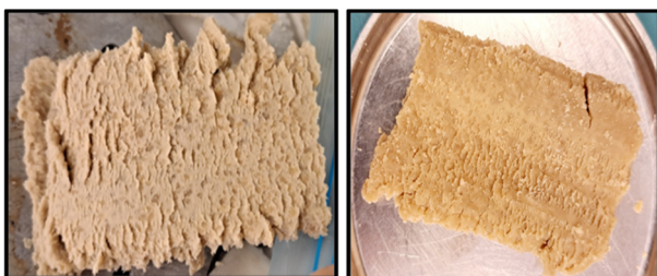
Fig. 4 Images of the extruded analogues without avocado oil.

Lipids also play a positive role in the extrusion process due to a lubricating effect in the mixing zones of the equipment. 24 This was confirmed when a test was performed that did not contain