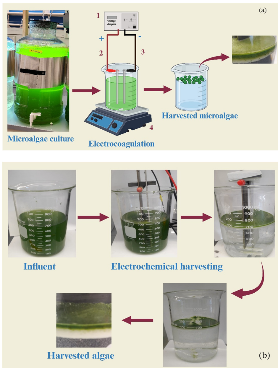
Fig. 1 (a) The schematical diagram of electrocoagulation of algae (1: power supply, 2: anode, 3: cathode, 4: magnetic stirrer); (b) a real application of electrochemical algae harvesting.

tested three different currents, including 0.1, 0.3, and 0.5 A (current density values: 1.64 , 4.92 , and 8.20 \text{ mA cm}^{-2} ). Three types of electrodes, including Al, Fe, and BDD were used, and the inter-electrode gap was kept constant at 1.0 cm throughout the study based on previous studies. 26,27 In addition, short distances like 1 cm decrease electrode power consumption and electrode passivation while enhancing process efficiency. 15 Four different electrode configurations, including BDD–Al, Al–Al, Fe–Fe, and Al–BDD, were used, and their effects on harvesting efficiencies were compared. The dimensions of the electrodes were 6.6 cm (width), 12 cm (length), and 2 mm (thickness), and the effective surface area was 61 \text{ cm}^2 . The electrodes were cleaned after each operation using nitric acid and acetone