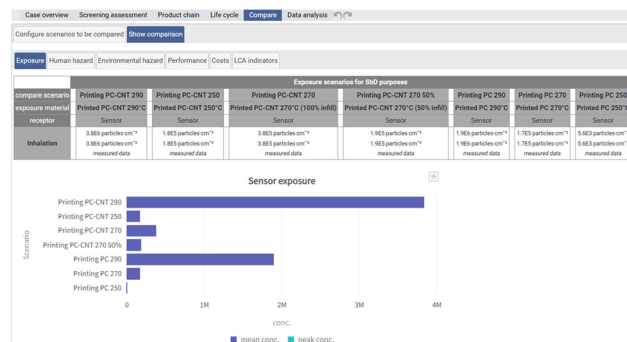
Fig. 5 Comparison of release results obtained by the air monitoring campaign performed before ( i.e. , PC-SWCNT.290) and after SbD implementations (PC-SWCNT.250, PC-SWCNT.270, and PC-SWCNT.270-50%) as well as during the production of the PC without SWCNTs ( i.e. , PC-290, PC-270, and PC-250).

Toxicological assessment. The detailed hazard assessment focused on inhalation exposure to IATA to compare the potential toxicity of the different alternatives. Information on