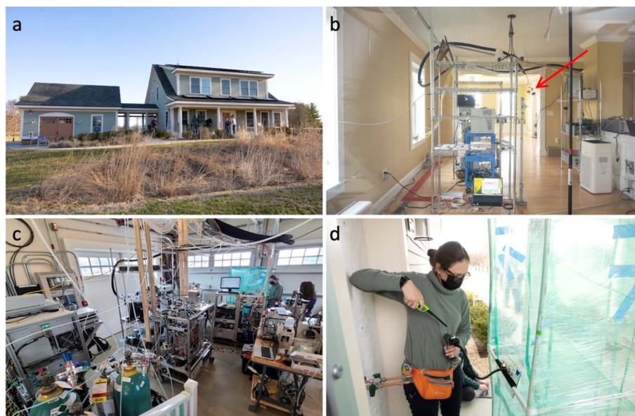
Fig. 1 Photos of (a) the NZERTF test house, with the garage holding instruments on left, joined by a breezeway to the main house. (b) The dining area contained surface samples, trace gas analyzers, low-cost sensors, and several particle sizing instruments. Inlets (marked with a red arrow) carried sample air to (c) instruments in the garage. (d) The smoke chamber in the breezeway enabled injection of aged smoke into the house.

While much of the reactive organic carbon in indoor air originates from the built environment and human activities indoors ( e.g. , cooking, cleaning), 2,10,27,28 outdoor air pollutants can also enter the built environment. Urban smog includes ozone (O 3 ), particulate matter, and other known air toxics. Wildfire smoke is an increasing concern in the western United States, 29 and is a well-established source of indoor particulate matter. 30,31 However, while the secondary chemistry of outdoor air pollution is well-studied, its behavior may be very different indoors due to high surface area to volume ratios, low light