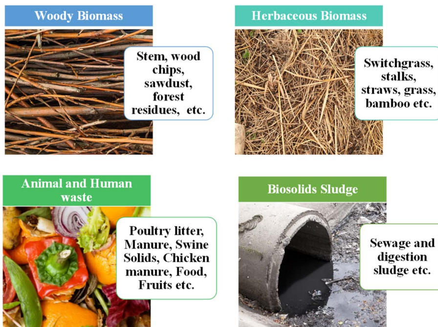
Fig. 2 Biomass feedstock categories. 39

Biofuels represent a category of sustainable fuels sourced from abundant biological materials known as biomass. This biomass encompasses diverse resources, including forestry products, agricultural residues such as straw, husks, and animal fat byproducts from food processing, industrial waste from pulp production and sewage, waste wood from construction and demolition and biodegradable waste. 44 Additionally, biofuels can be obtained from specific energy crops cultivated