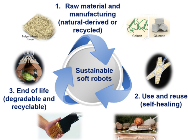
Fig. 1 The life cycle assessment of sustainable soft robots. Three main phases are classified from cradle to grave. Raw materials that are natural or recycled and manufacturing encode the original sustainable character at the start-of-life. Self-healing enables to reuse and refunction from damage at the middle-of-life. Degradable and recyclable allows degradation and recycle into a new life at the end-of-life instead of being discarded directly.

Inspired by living organisms which can heal and recover from injury, self-healable robots would reuse and refunction after damage with expanded lifetime. Self-healing function in robots